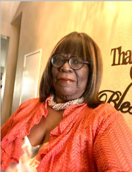
Charlotte couldn't make it to the church, but she watched at home in her orange outfit.