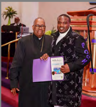
Name: Prince Siddiq